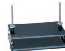
F Universal adaptor Allows for using common vessels and test tube racks; max. span height: 160 mm P/N 549-30000-00