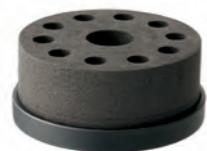
A Attachment for 10 test tubes Foam attachment provides space for 10 test tubes for simultaneously mixing with just one shaker P/N 549-01000-00