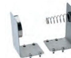
E Separatory funnel clamp (250 ml, 500 ml, 1000 ml) For perforated platform 2000, space for max. 4 (250-ml), 3 (500-ml) or 3 (1000-ml) clamps P/N 549-57000-00