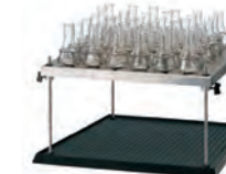
E Multi-tier attachment Includes perforated platform 2000 and 4 supporting rods P/N 549-62000-00