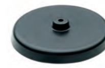
G Tension plate for caps Allows for the use of common bottles with Ø 94 mm P/N 11-001-001-81