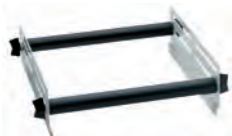
B Tension roller attachment Attachment with 2 tension rollers P/N 549-81000-00