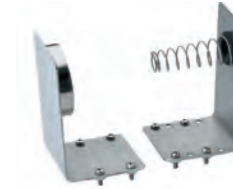
E Separatory funnel clamp (2000 ml) For perforated platform 2000, space for max. 2 clamps P/N 549-61000-00