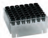
C Test tube attachment For up to 49 test tubes with Ø 12 mm, length up to 80 mm P/N 549-82000-00

For up to 36 test tubes with Ø 16 mm, length up to 80 mm P/N 549-83000-00