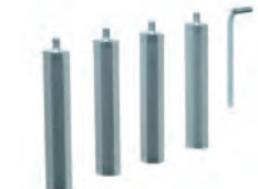
G Attachment for 0.5-l bottles (Set of 4) Allows for the use of four 0.5-l bottles P/N 549-27000-00